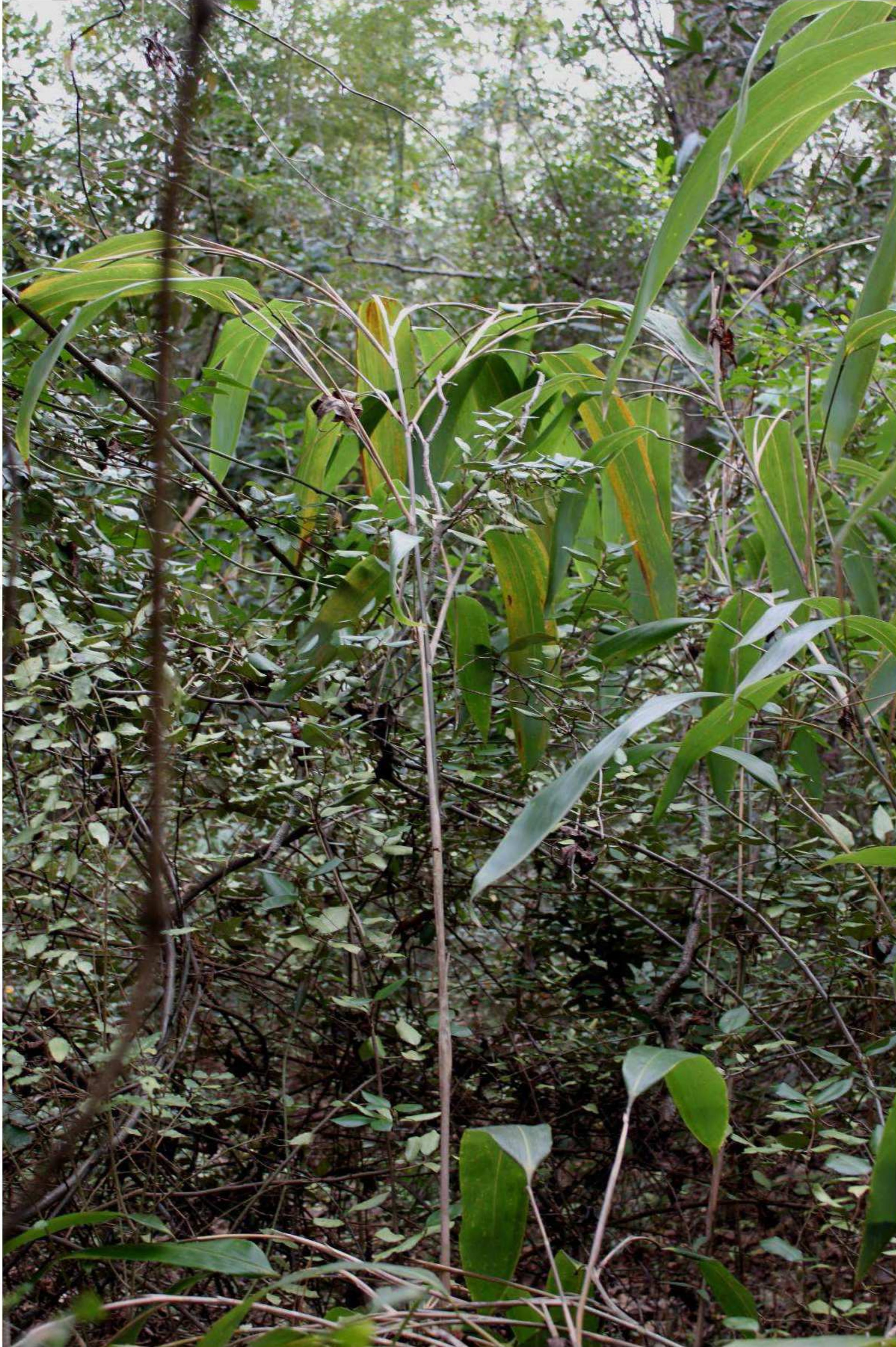
Figure 11. Pseudosasa japonica (Poaceae).